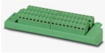
Bus bar, triple row