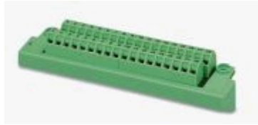
Bus bar, double row