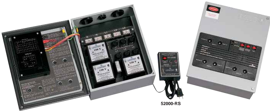
57000 Series panels Shown with 52000-RS Remote Supervisor, features easy-to-install replaceable modules.