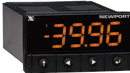
Pt32 Series shown actual size.