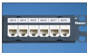
Patch Panel Labeling