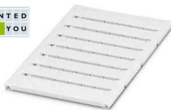
Markers for terminal block widths up to 16 mm