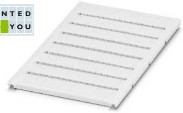
Markers for terminal block widths up to 8.2 mm