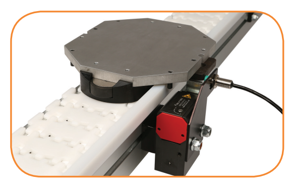
Cushioned Pallet Stop