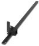
Measuring bar, version: inches/metric

Accessories for tools - PPS COMPACT/SCALE-SET I/M - 1105211