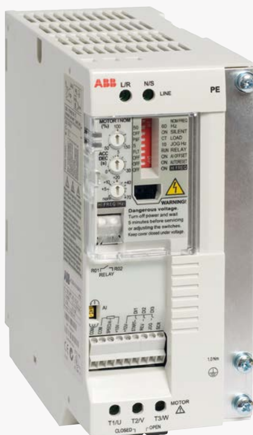
ABB micro drives ACS55, 0.18 to 2.2 kW