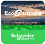
EcoStruxure Secure Connect Advisor