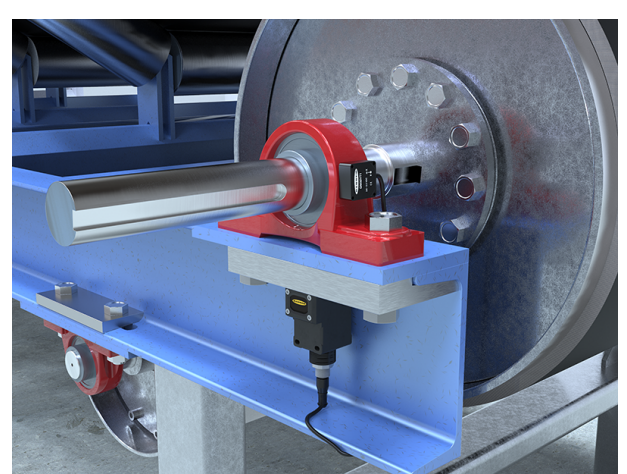
Figure 1. Install the vibration sensor

Correctly mounting the vibration sensor on a motor is important to collect the most accurate readings. There are some considerations when it comes to installing the sensor.