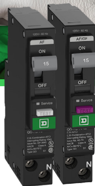
AF and AFGF dual function circuit breakers