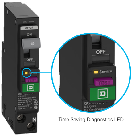
Time Saving Diagnostics LED