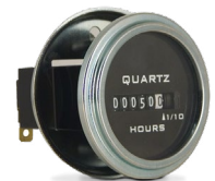
Stainless Bezel Available