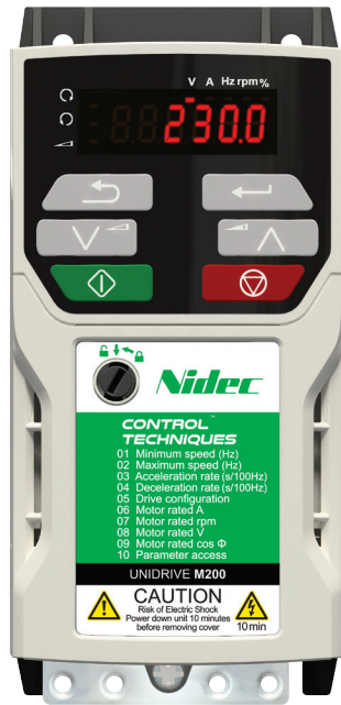
Unidrive M200 Frame Size 1